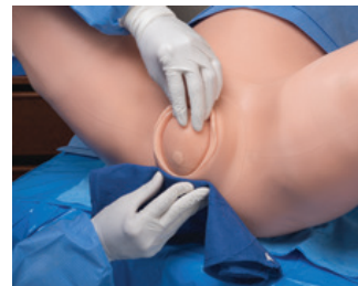
Illustrate descent, rotation, and expulsion