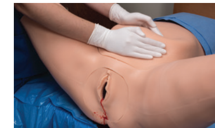
Soft abdomen and adjustable uterine tone for massage training

The neonate's smooth skin and articulated limbs support the use of real instruments and advanced maneuvers.