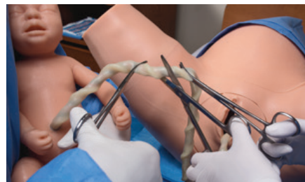
Umbilical cord clamping and cutting