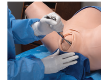
Forceps indication, application, and traction