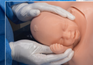
Articulated joints provide realistic resistance