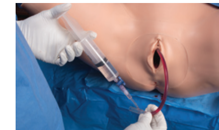
Cervix and uterus allow for tamponade placement and hemorrhage control