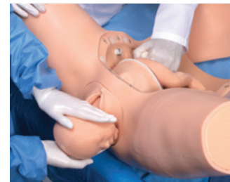
Removable abdomen offers an internal view of the birth