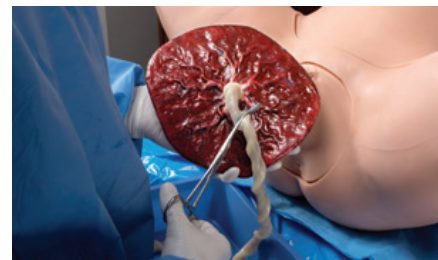
Placenta delivery and examination