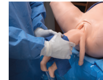
Breech maneuvers: Pinard's, Mauriceau, Ritgen's, Lovset