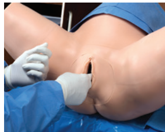
Palpable pelvic landmarks and dilating cervix