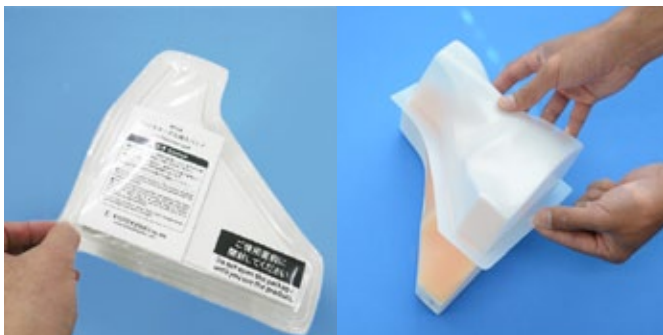
1. Open the CVC pad.