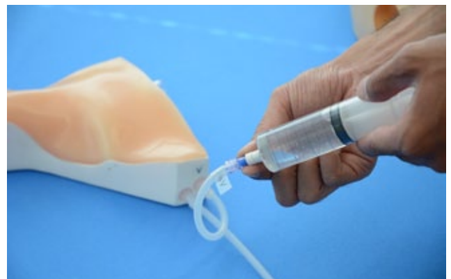
3. Connect the 50ml syringe to the tube and slowly inject with 50ml syringe twice (100ml of water) while raising the edge of the body to fill the tubes with liquid.

When attaching the vein pipe, please do not screw the pipe.