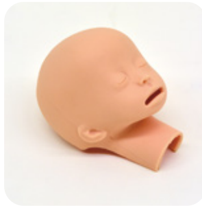
Mask for MW33